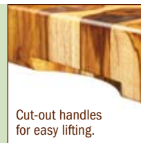
Cut-out handles for easy lifting.