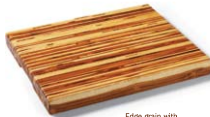
Edge grain with side handles.