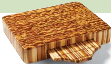
End grain with inset cutting boards.

Useful features and eye-catching designs.