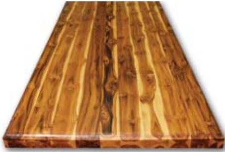
Face Grain/Single bevel.*

Teak wood is ideally suited for demanding kitchen environments. On a functional level, teak is an extremely durable wood that can stand up to the daily wear and tear of kitchen life. On an aesthetic level, teak countertops and islands are a distinct and attractive alternative to more common materials like maple and granite.