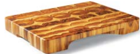
End grain with side handles and front bowl cut-out.