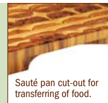
Sauté pan cut-out for transferring of food.

Proteak also offers several features that can be added to our classic cutting boards. These