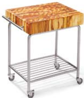
Butcher Block Carts